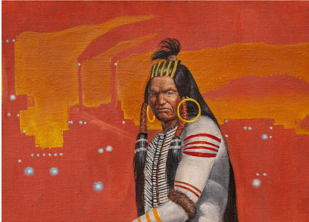
Ute Warrior painting by Redbird Willie (Pomo, Paiute, Wintu and Wailaki)

https://www.eventbrite.com/e/dei-strategies-and-best-practices-to-support-your-nonprofit-workplace-tickets-1045520679497?aff=oddtcreator